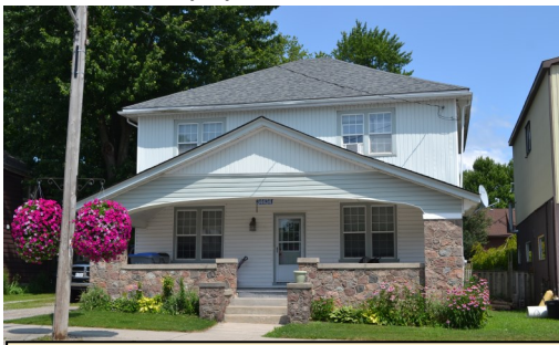
House where the church first met.