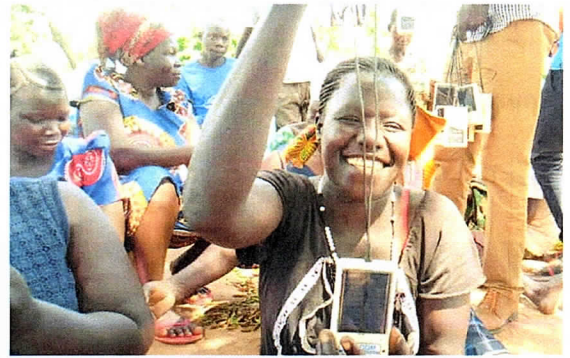
A South Sudanese Refugee in Uganda