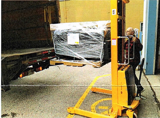
OmniStations for Ukraine leaving our warehouse.

Thank you for being a part of the Galcom team! Your gift of $1,000.00 towards Ukraine Go-Tell & ImpaX Radios provides both the material and spiritual encouragement we need.