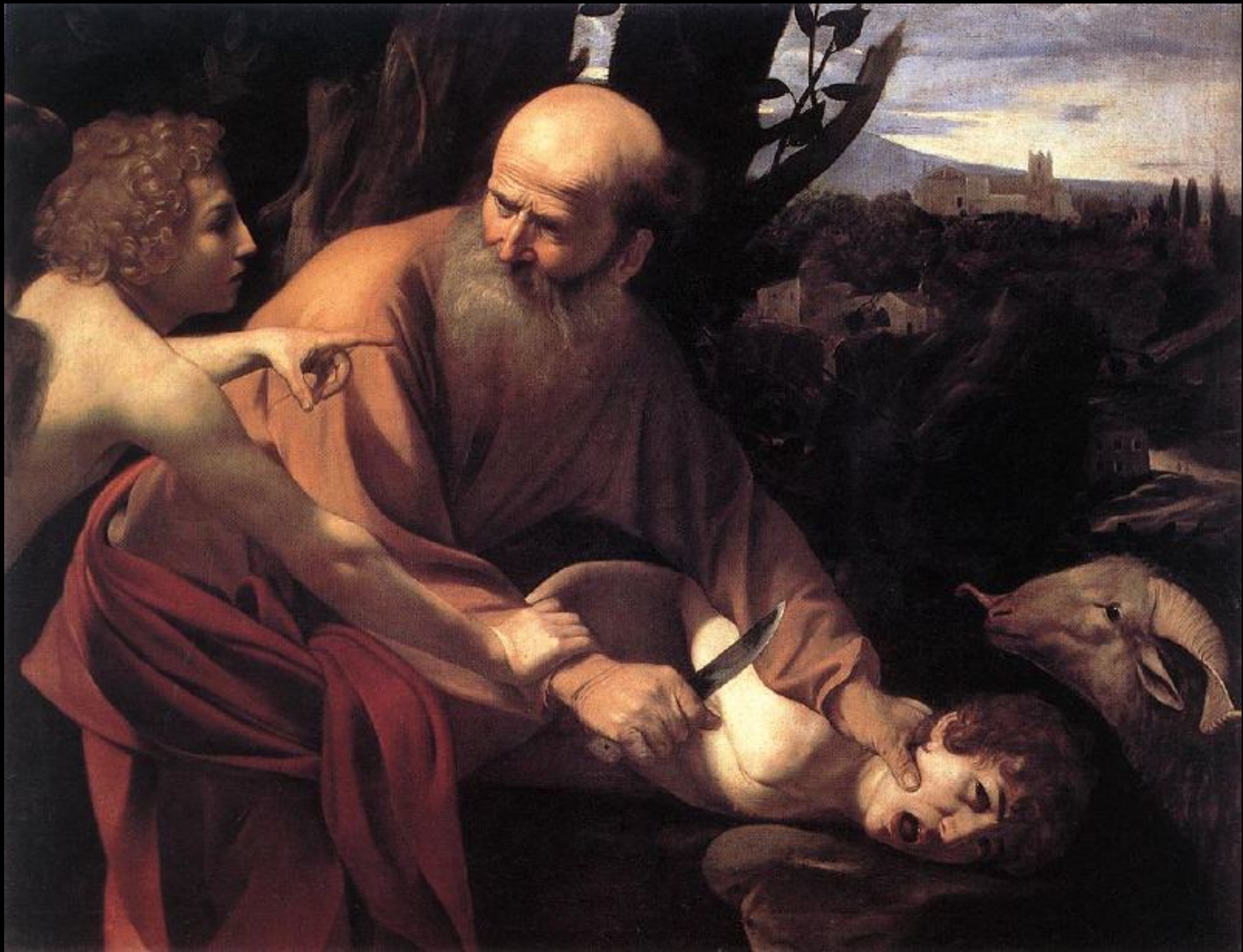
Caravaggio, "The Sacrifice of Isaac," 1603